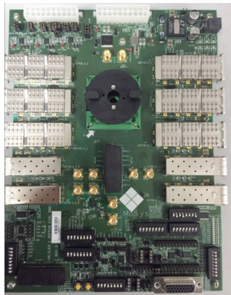
17x17mm QSFP28 Evaluation Board and reference